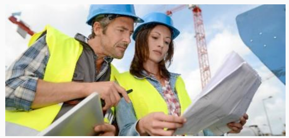
Preventing Workplace Misconduct: A Leadership Imperative by Cal Beyer, Ashley Seitz

The culture of construction has been described as one that perpetuates racism, discrimination, and sexual harassment. In fact, it may take a fleet of excavators to dig the industry out of the hole it is in with the U.S. Equal Employment Opportunity Commission (EEOC).